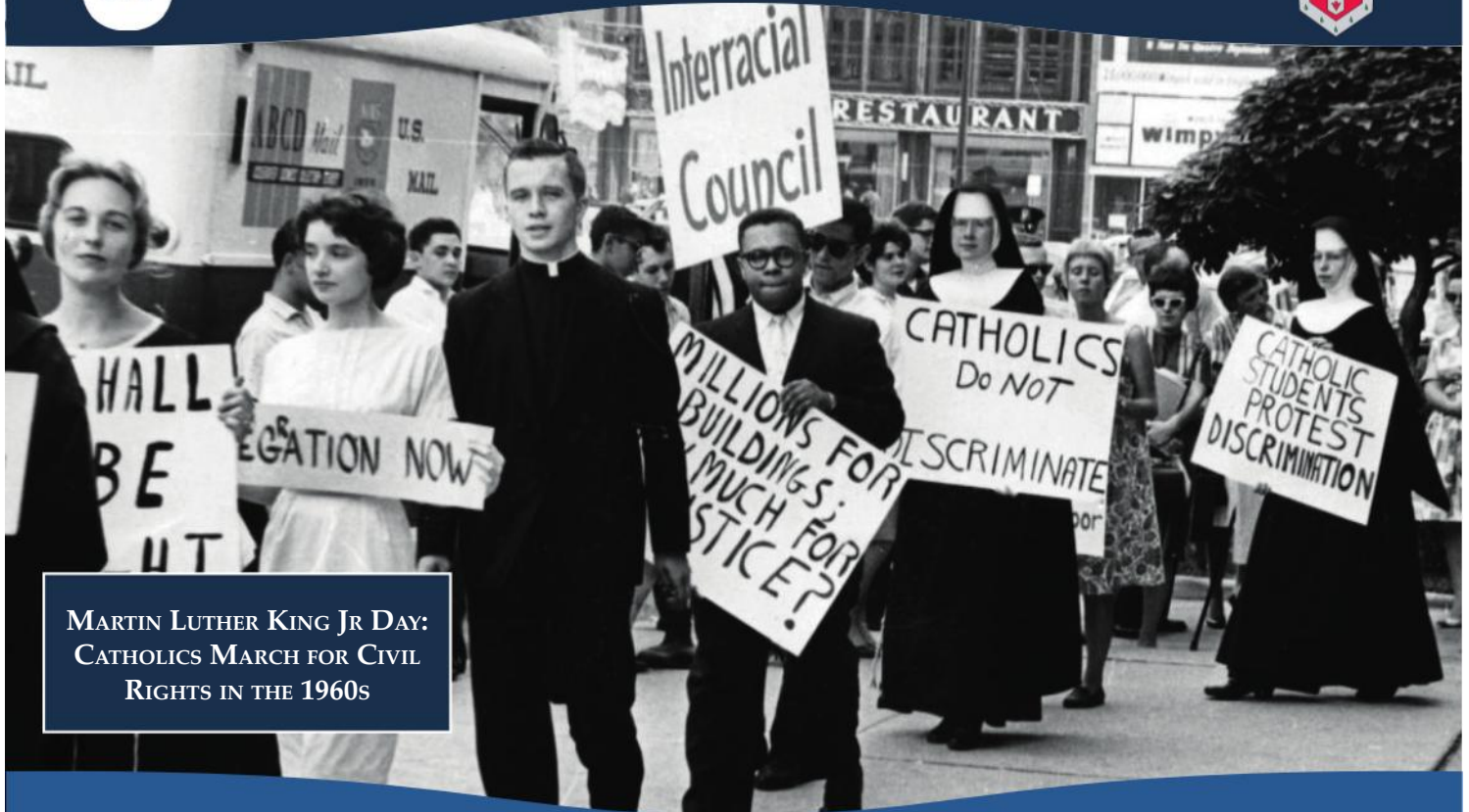
MARTIN LUTHER KING JR DAY: CATHOLICS MARCH FOR CIVIL RIGHTS IN THE 1960S

TRANSFORMED BY THE LOVE OF JESUS, WE ARE COMPELLED BY GRATITUDE AND CALLED TO ACT.